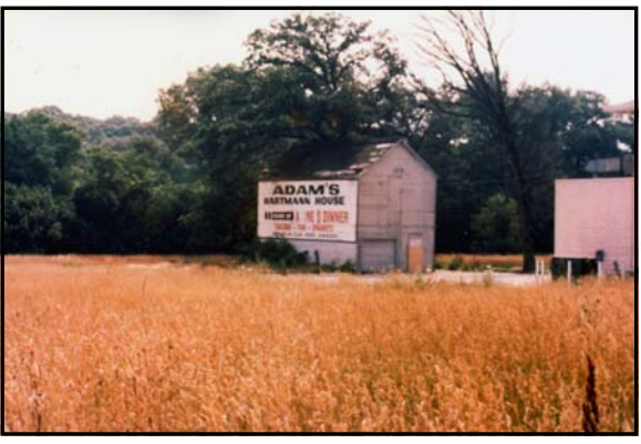
The ice house on the Des Plaines River ca. 1982

Remember the wood-smoky, smoldering scent of raked, burning leaves? The sweet and spicy scents of autumn candles and potpourri. The sight of children running door-to-door in the twilight, wearing homemade costumes,