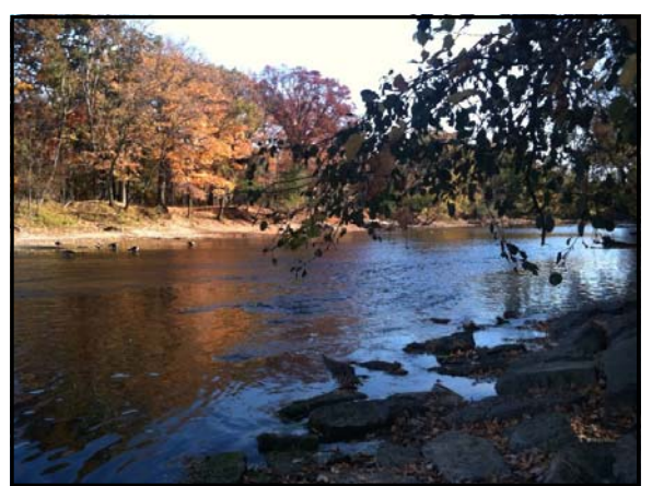
Des Plaines River at Dam No. 1 October 2010