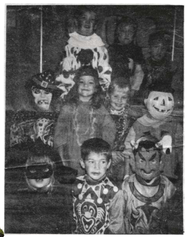
Halloween at the Wheeling Park District ca.1971